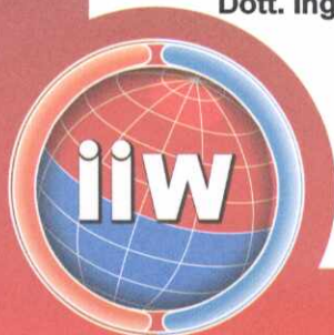
Geom. Emilio Miniussi

The standards and documents referred in the certificate and schedule are those valid at the time of certification